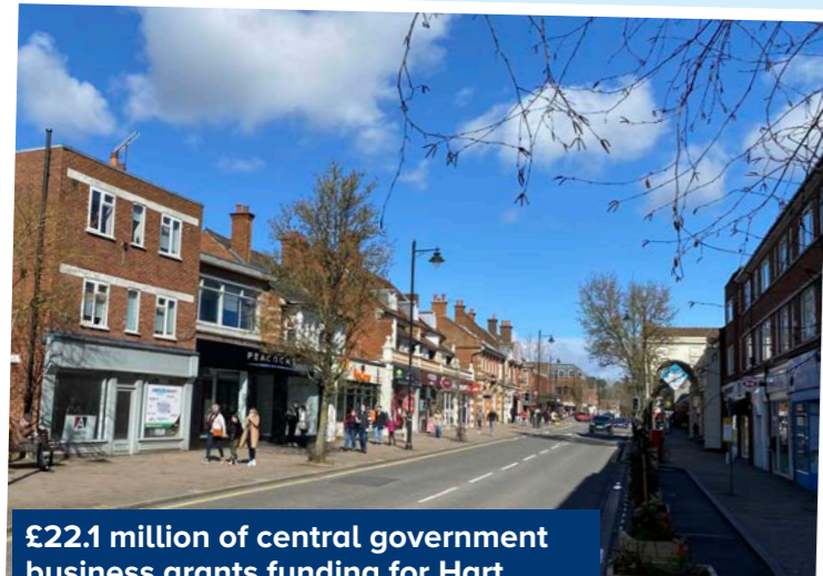
£22.1 million of central government business grants funding for Hart.