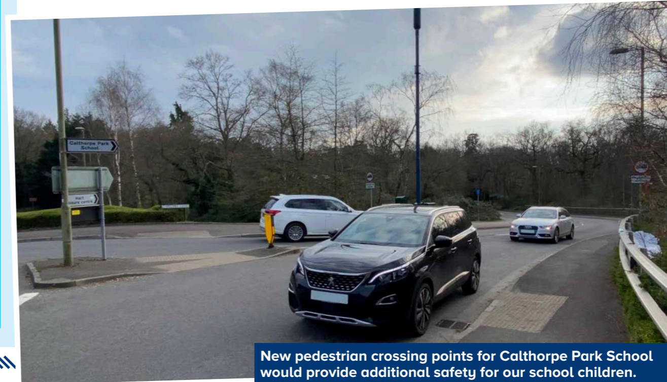
New pedestrian crossing points for Calthorpe Park School would provide additional safety for our school children.

We also commit to either widen the pavement along Hitches Lane or create a new cycle route to the school from West Fleet and Elvetham Heath.