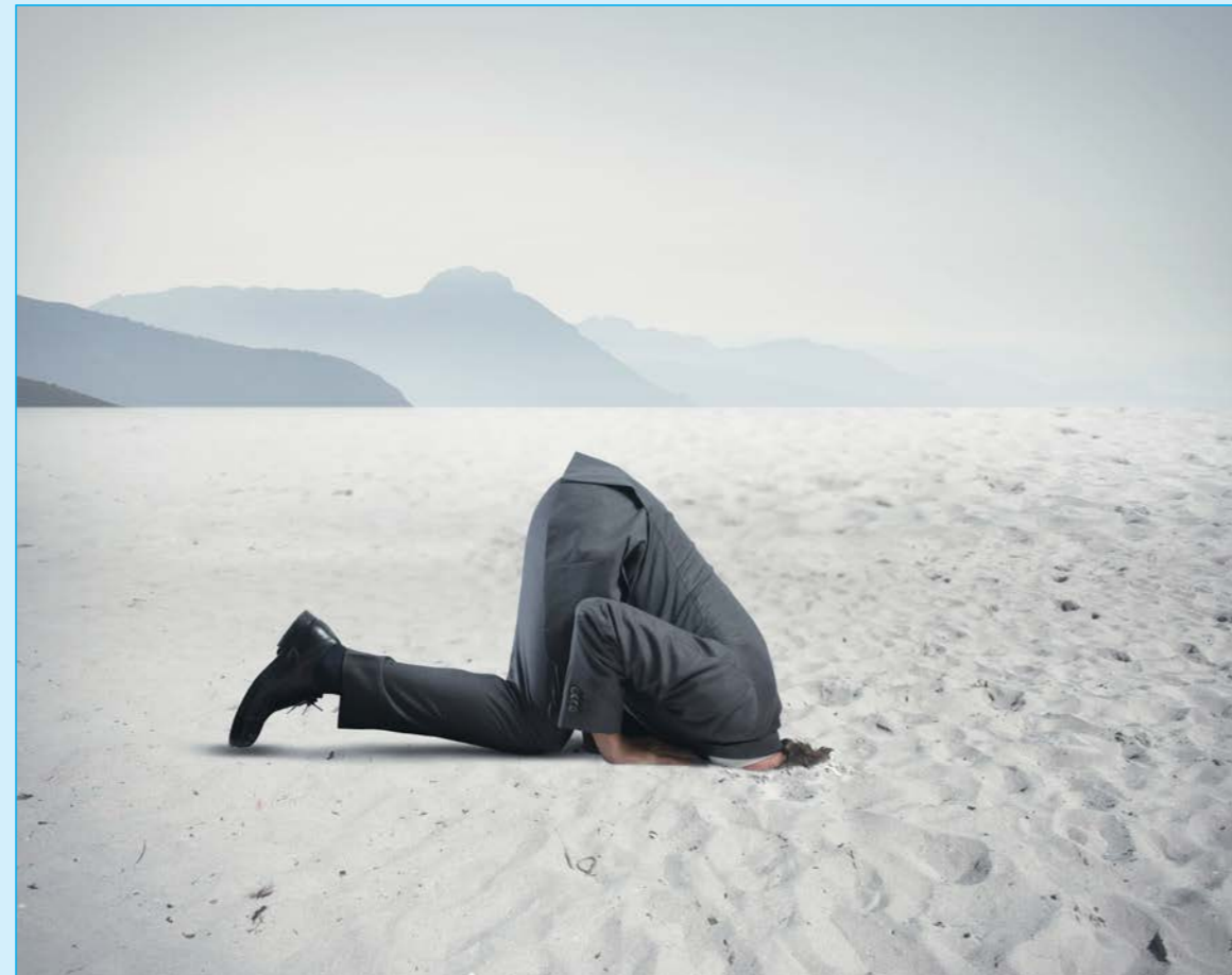
The ruling CCH/LibDem administration have their heads buried in the sand and have failed to tackle the impending black hole in Council finances.

The choice is clear. A Conservative run Council, with a track record of delivering balanced budgets, cost-effective services, generating £1.2 million of revenue each year from the new £23 million leisure centre and building reserves. Or a CCH/LibDem run Council who are planning to fail.