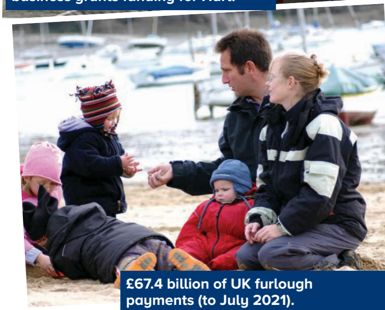
£67.4 billion of UK furlough payments (to July 2021).