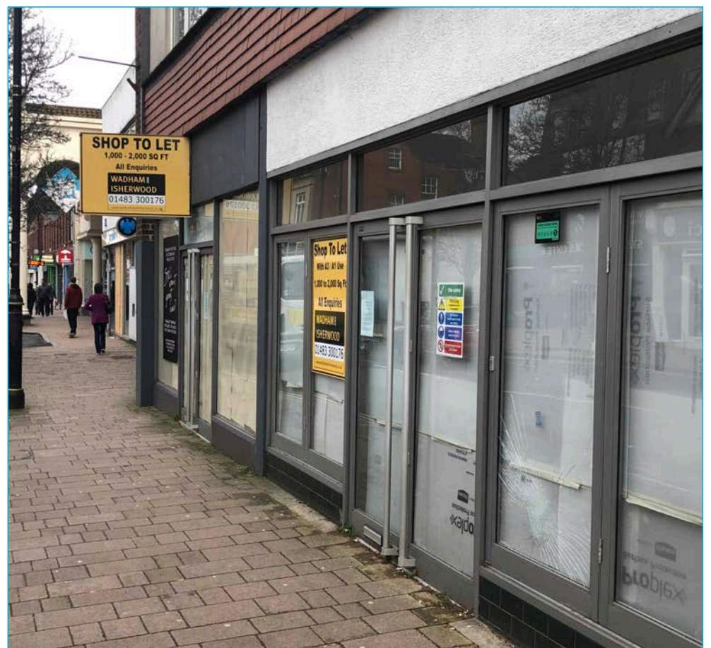
Hart Conservatives will invest to revitalise Fleet town centre.

In contrast, the CCH/LibDem led Council are only looking to monetise the Civic Quarter in Fleet. They have made no progress with their plans over the past few years and have again taken the decision to delay any community engagement until after the local elections. By focussing only on the Harlington, this once again brings into question the future of Gurkha Square and the library.