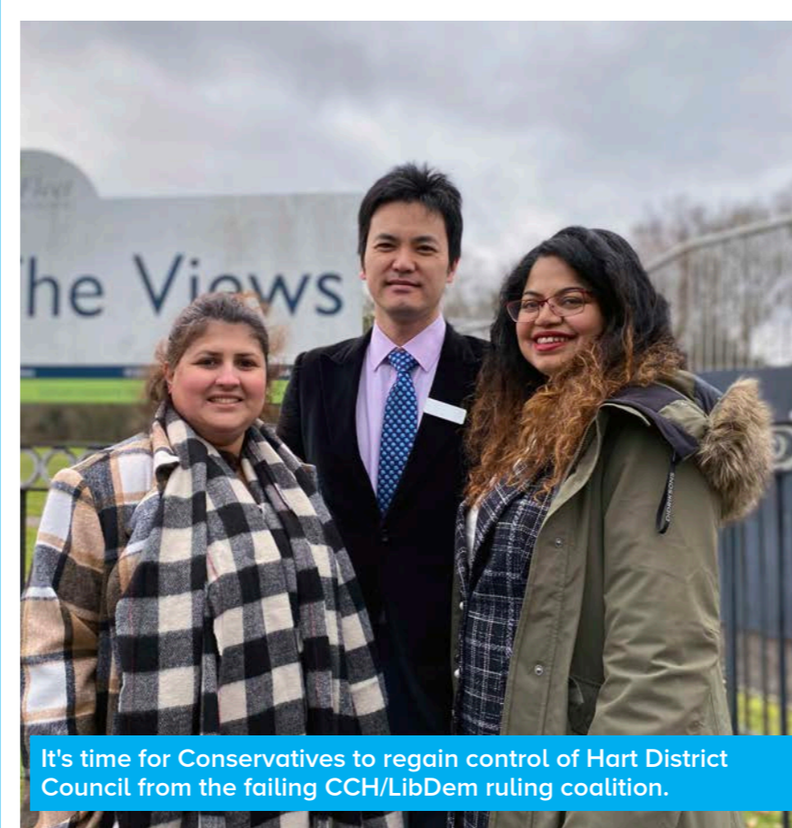
It's time for Conservatives to regain control of Hart District Council from the failing CCH/LibDem ruling coalition.